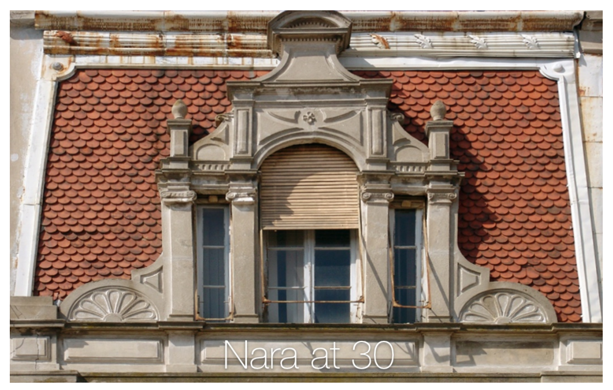
Customs House, Port of Thessaloniki

ICOMOS TheoPhilos ISC Conference Authenticity from a European Perspective: 30 Years of the Nara Document on Authenticity Thessaloniki, Greece, November 28 - 29, 2024 Multi-purpose Cultural Venue "Islahane", Thessaloniki